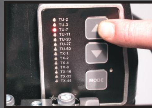
PUSH BUTTON TOOL SELECTION FOR TORCUP TU AND TX WRENCHES